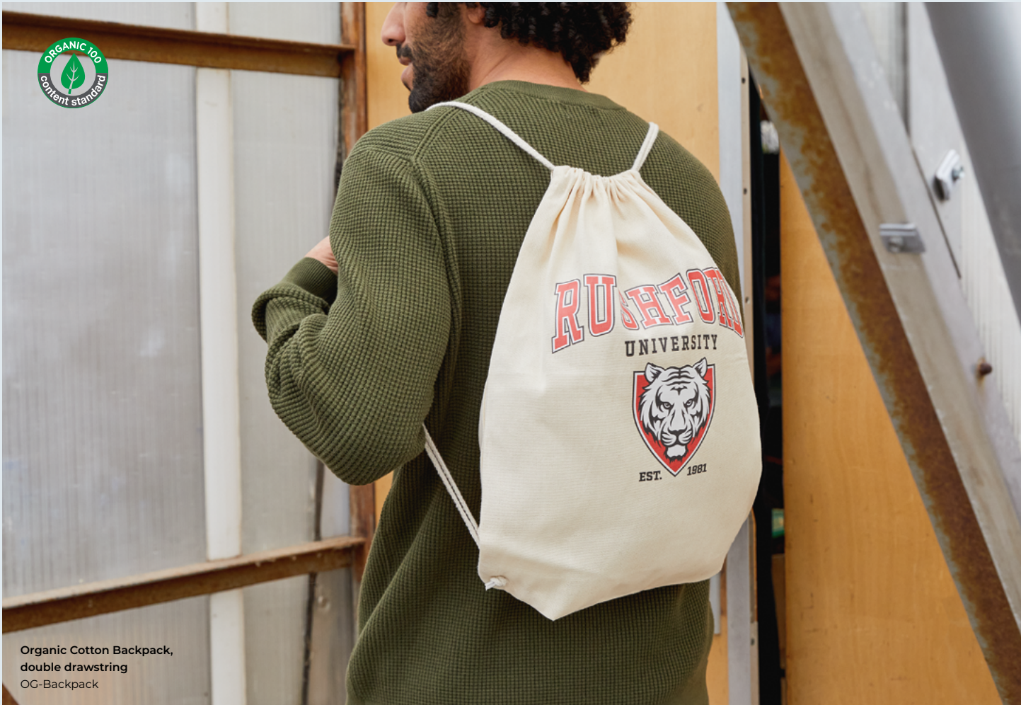
Organic Cotton Backpack, double drawstring OG-Backpack

If you are looking to attract fashionistas, jump on the texture trend with our exclusive range of felt shoppers and handbags. Ideal for decoration from print to laser engraving, they will stay stylish and understated because of the heavier quality felt we use.