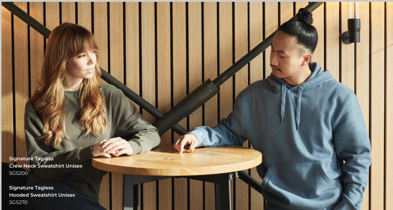
Signature Tagless Crew Neck Sweatshirt Unisex SCS200

Contemporary cuts, stylish fits, premium fabrics, and a top-quality finish. These are the hallmarks of each SG Signature style. Attention to detail in the design, strict selection of fabrics to ensure the best fit and drape (and decoration), a focus on wearer comfort and obviously an elegant look all come together in each style of this collection.