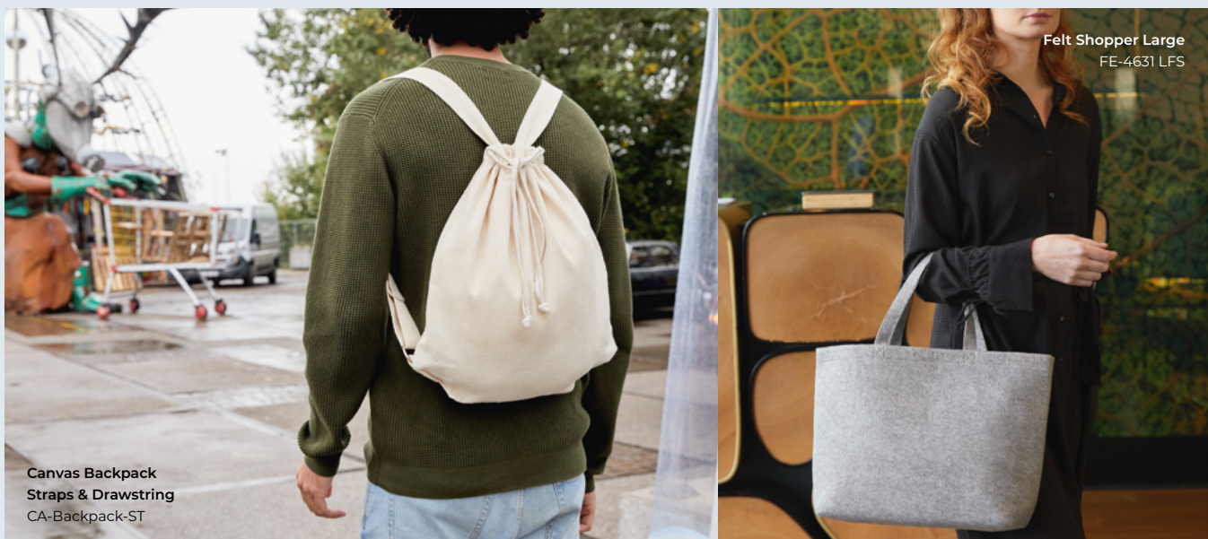
Canvas Backpack Straps & Drawstring CA-Backpack-ST

Best known for its market leading cotton shoppers, the SG Accessories Bags range offers a full collection of functional and fashionable bags. The minimalistic designed styles are perfect to be decorated to meet various needs from promotions to retail.