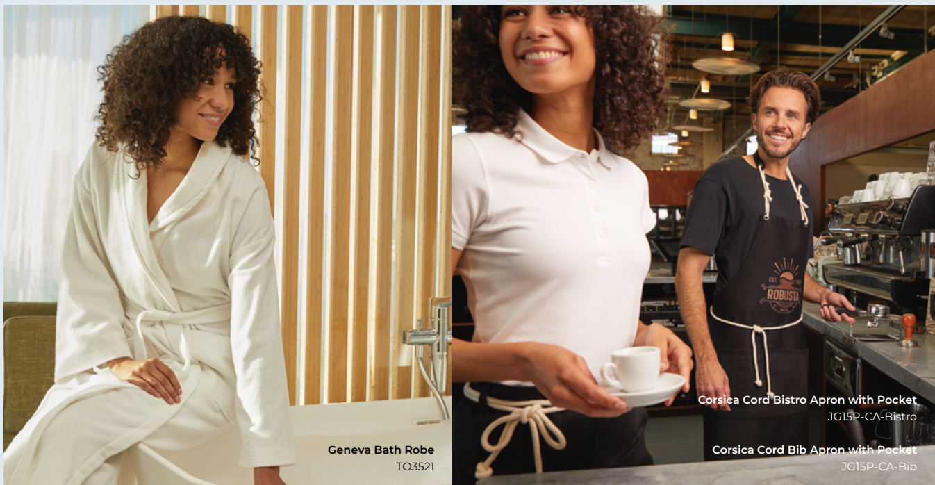
Geneva Bath Robe TO3521

Driven by the same high production values as for our garments collections, our SG Accessories ranges are designed to deliver best-selling and contemporary products in quality fabrics that can be used in a wide range of environments for professional and personal use.