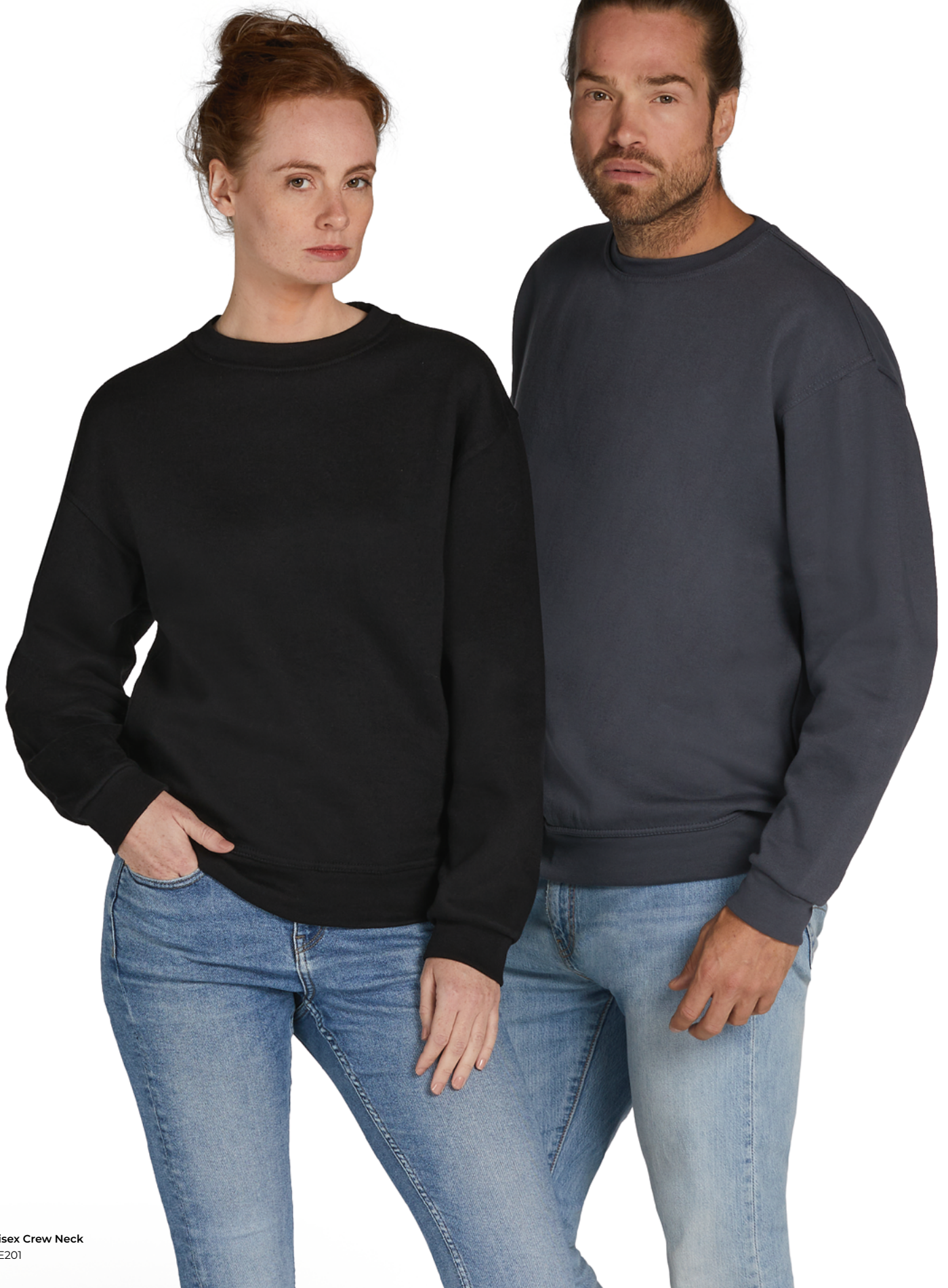
Unisex Crew Neck SGE201