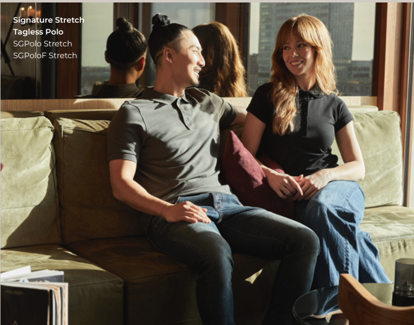
Signature Stretch Tagless Polo SGPolo Stretch SGPoloF Stretch