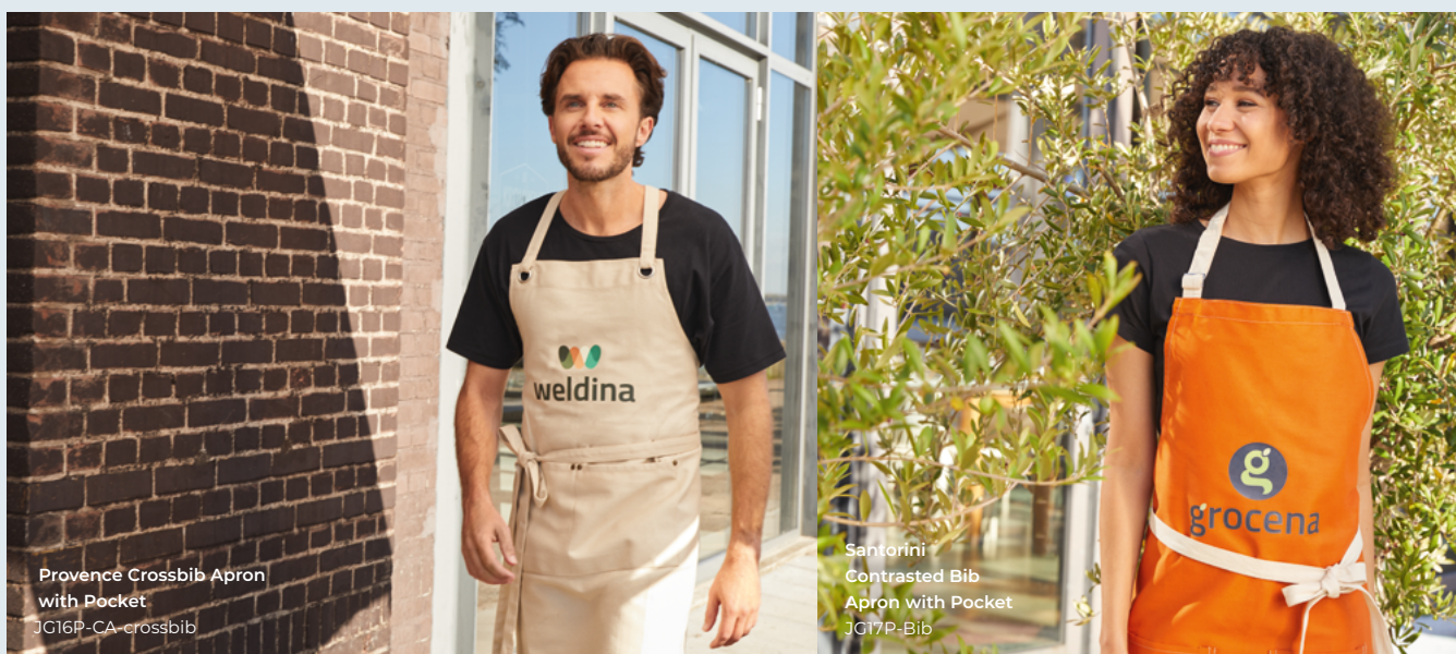
Provence Crossbib Apron with Pocket JC16P-CA-crossbib

From fine dining to casual eateries, cafés to bars, corporate canteens to funky beach lounges or boutique Hotel receptions, you'll notice that crisp and colourful aprons are all the rage for cooks, bar and serving staff. Join the trend with SG Accessories Bistro, a range of aprons available in up to 20 colours and a wide range of fabrics to meet all your needs.