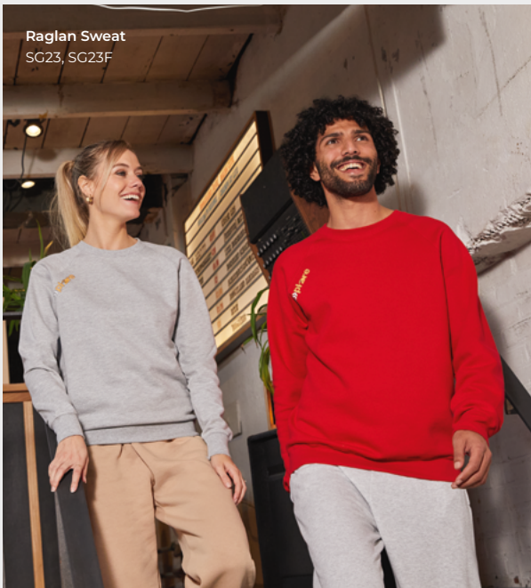
Raglan Sweat SG23, SG23F