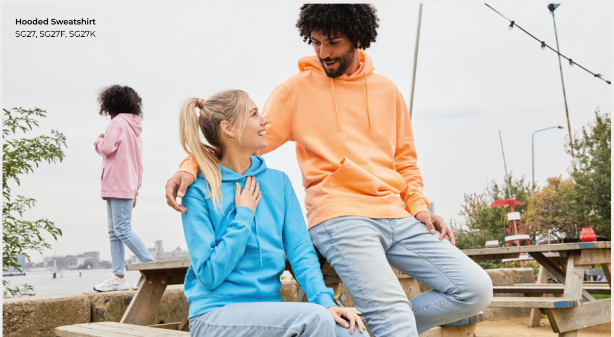
Hooded Sweatshirt SG27, SG27F, SG27K