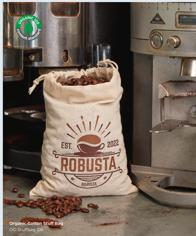
Organic Cotton Stuff Bag OG-Stuffbag-DS

Discover the SG Accessories Bags range and choose your style, for function or fashion.